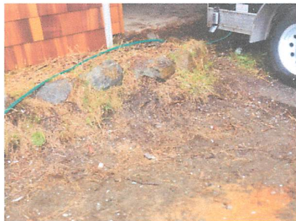
July 25, 2018, Photo 20180725_120221.jpg