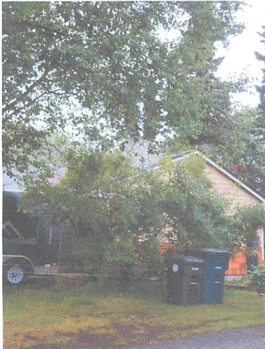
July 25, 2018, Photo 20180725_115646.jpg

Photo 20180725_115121.jpg taken July 25, 2018 at 11:51 a.m. is a picture of the work truck owned by Greenbuild Design, parked on the street near the active renovation site located at 2208 Turnagain, Anchorage, Alaska. Photo 20180725_115135.jpg taken July 25, 2018 at 11:51 a.m. is a picture of the work trailer owned by Greenbuild Design parked in the driveway of the target property.