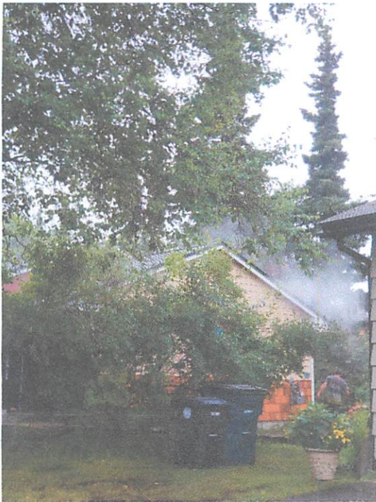
July 25, 2018, Photo 20180725_115707.jpg

Photo 20180725_115646.jpg taken July 25, 2018 at 11:56 a.m. during the onsite inspection for property located at 2208 Turnagain, Anchorage, Alaska shows the water mist that can be seen spraying above the roof from the backyard towards the front of the house during the active pressure washing that could be heard from the street. The photograph also shows a worker on the right side of the target property during the active pressure washing. Photo 20180725_115648.jpg taken July 25, 2018 at 11:56 a.m. shows water mist going above the roof from the active pressure washing being completed from the backyard of the target property during the inspection. The photograph also shows a worker on the right side of the target property during the active pressure washing.