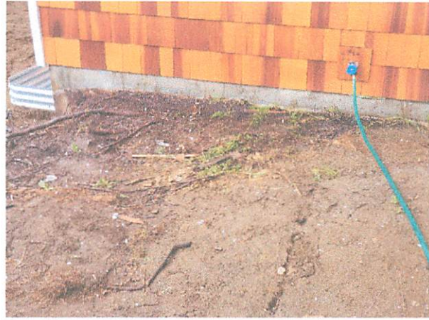
July 25, 2018, Photo 20180725_120057.jpg

Photo 20180725_120029.jpg taken July 25, 2018 at 12:00 p.m. shows visible paint chips on bare ground in front of the property to the right of the front porch close to the foundation located at 2208 Turnagain, Anchorage, Alaska. The photograph indicates that no containment was utilized during active renovation work. Photo 20180725_120057.jpg taken July 25, 2018 at 12:00 p.m. shows visible paint chips on bare ground close to the foundation to the left side of the front porch of the same property. The photograph indicates that no containment was utilized during active renovation work.