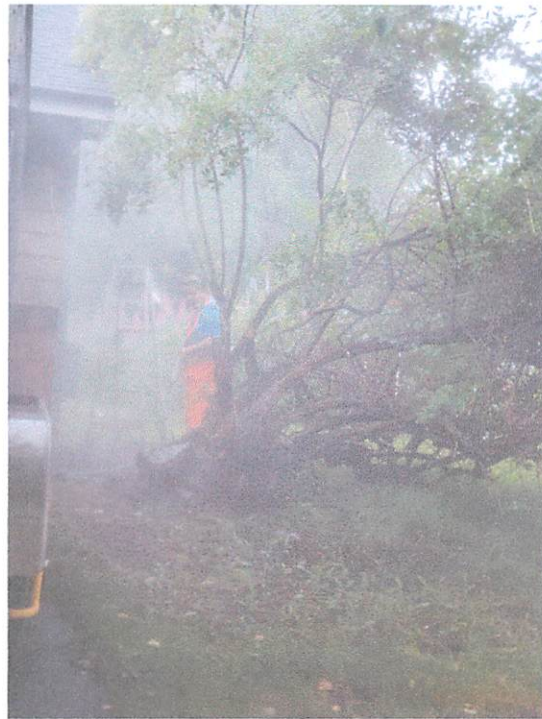
July 25, 2018, Photo 20180725_115932.jpg

Photo 20180725_115707.jpg taken July 25, 2018 at 11:57 a.m. shows water mist from the backyard of the target property going above the roof towards the front of the property during the active pressure washing at property located at 2208 Turnagain, Anchorage, Alaska during the onsite inspection. The photograph shows a worker walking in the backyard. Photo 20180725_115932.jpg taken July 25, 2018 at 11:59 a.m. shows water mist from the active pressure washing in the backyard of the target property during the onsite inspection. The photograph also shows a worker behind the house while the target property during the pressure washing. The photograph is evidence showing there is no containment being utilized during the pressure washing, and no signs posted during the active renovation work.