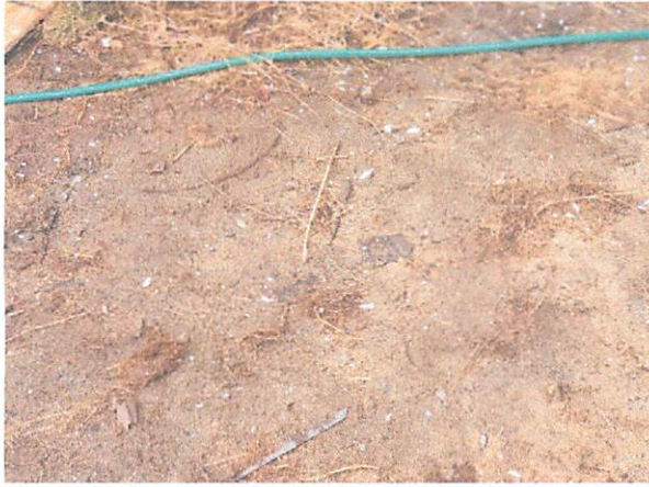
July 25, 2018, Photo 20180725_120029.jpg