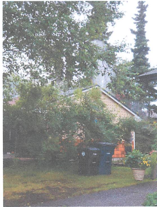
July 25, 2018, Photo 20180725_115648.jpg