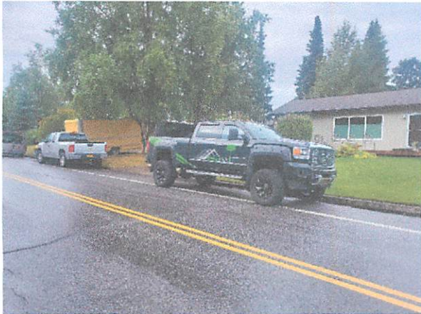
July 25, 2018, Photo 20180725_115121.jpg