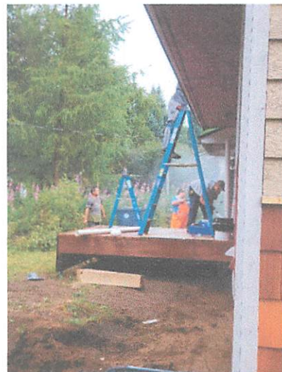
July 25, 2018, Photo 20180725_120128.jpg

Photo 20180725_120105.jpg taken July 25, 2018 at 12:01 p.m. shows visible paint chips on bare ground to the left of the house next to the foundation of target property located at 2208 Turnagain, Anchorage, Alaska. The photograph indicates that no containment was utilized