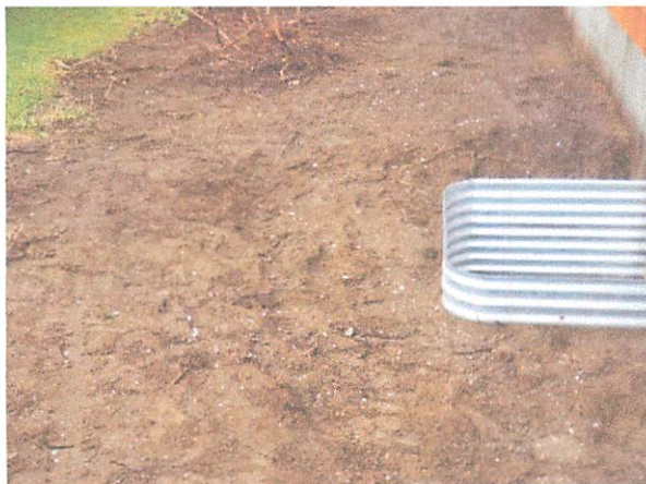
July 25, 2018, Photo 20180725_120105.jpg

Photo 20180725_120029.jpg taken July 25, 2018 at 12:00 p.m. shows visible paint chips on bare ground in front of the property to the right of the front porch close to the foundation located at 2208 Turnagain, Anchorage, Alaska. The photograph indicates that no containment was utilized during active renovation work. Photo 20180725_120057.jpg taken July 25, 2018 at 12:00 p.m. shows visible paint chips on bare ground close to the foundation to the left side of the front porch of the same property. The photograph indicates that no containment was utilized during active renovation work.