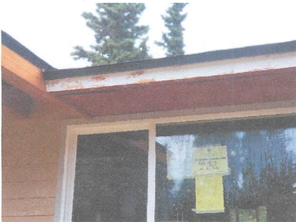
July 25, 2018, Photo 20180725_120227.jpg

Photo 20180725_120145.jpg taken July 25, 2018 at 12:01 p.m. shows trimming that looks to have been prepped for painting by scraping the paint off. The trimming is located on the left side towards the backyard of the target property located at 2208 Turnagain, Anchorage, Alaska. Photo 20180725_120152.jpg taken July 25, 2018 at 12:01 p.m. shows the full trimming that looks to have been prepped for painting by scraping the paint off. The trimming is located on the left side of the target property