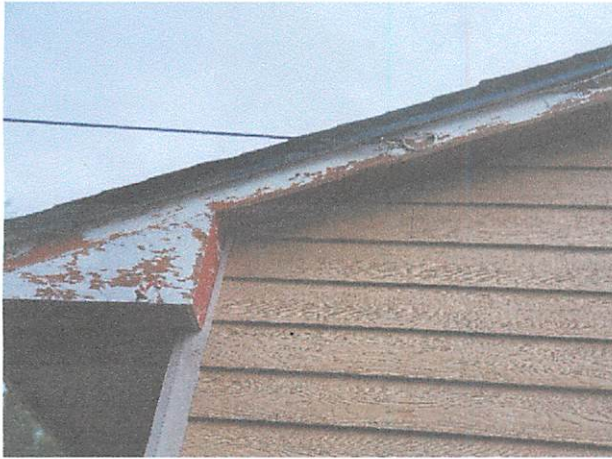
July 25, 2018, Photo 20180725_120145.jpg

during active renovation work. Photo 20180725_120128.jpg taken July 25, 2018 at 12:01 p.m. shows active pressure washing in backyard of target property during the onsite inspection. The photograph shows three workers performing active renovation work during the inspection. The photograph shows that no containment is being utilized during the active renovation work.