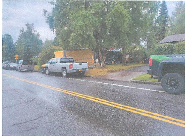
July 25, 2018, Photo 20180725_115135.jpg

Photo 20180725_115121.jpg taken July 25, 2018 at 11:51 a.m. is a picture of the work truck owned by Greenbuild Design, parked on the street near the active renovation site located at 2208 Turnagain, Anchorage, Alaska. Photo 20180725_115135.jpg taken July 25, 2018 at 11:51 a.m. is a picture of the work trailer owned by Greenbuild Design parked in the driveway of the target property.